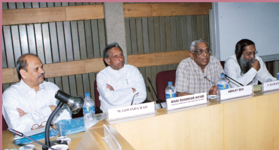
Workshop on Planning at the Grassroots Level, May 8-9, 2006