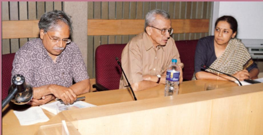
Refresher Course on Public Economics for College/University Teachers, sponsored by the World Bank, June 6 - July 2, 2005