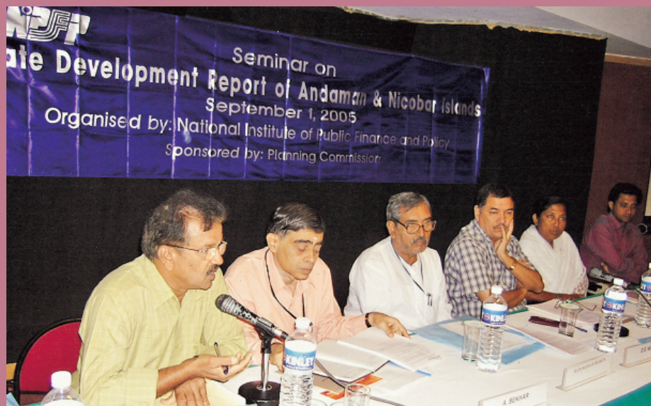
At India Habitat Centre, New Delhi