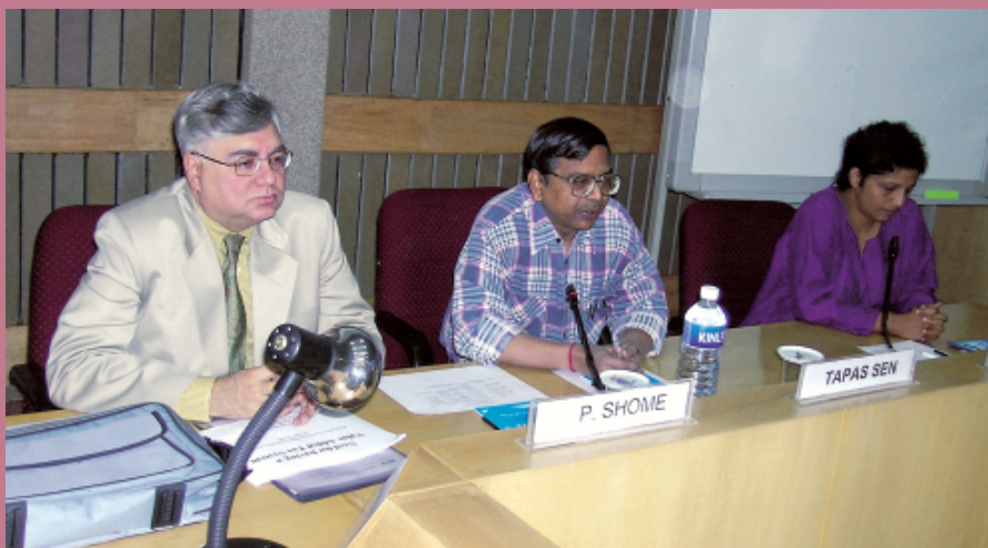
VAT Programme sponsored by the British High Commission, Nov 14-18, 2005