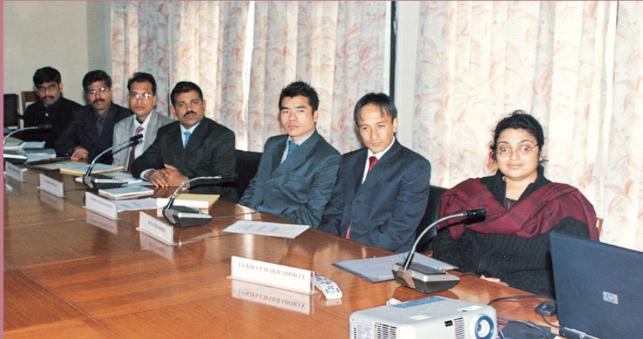
Course on Public Finance for in-service probationers of IA& AS, Jan, 30– Feb 17, 2006