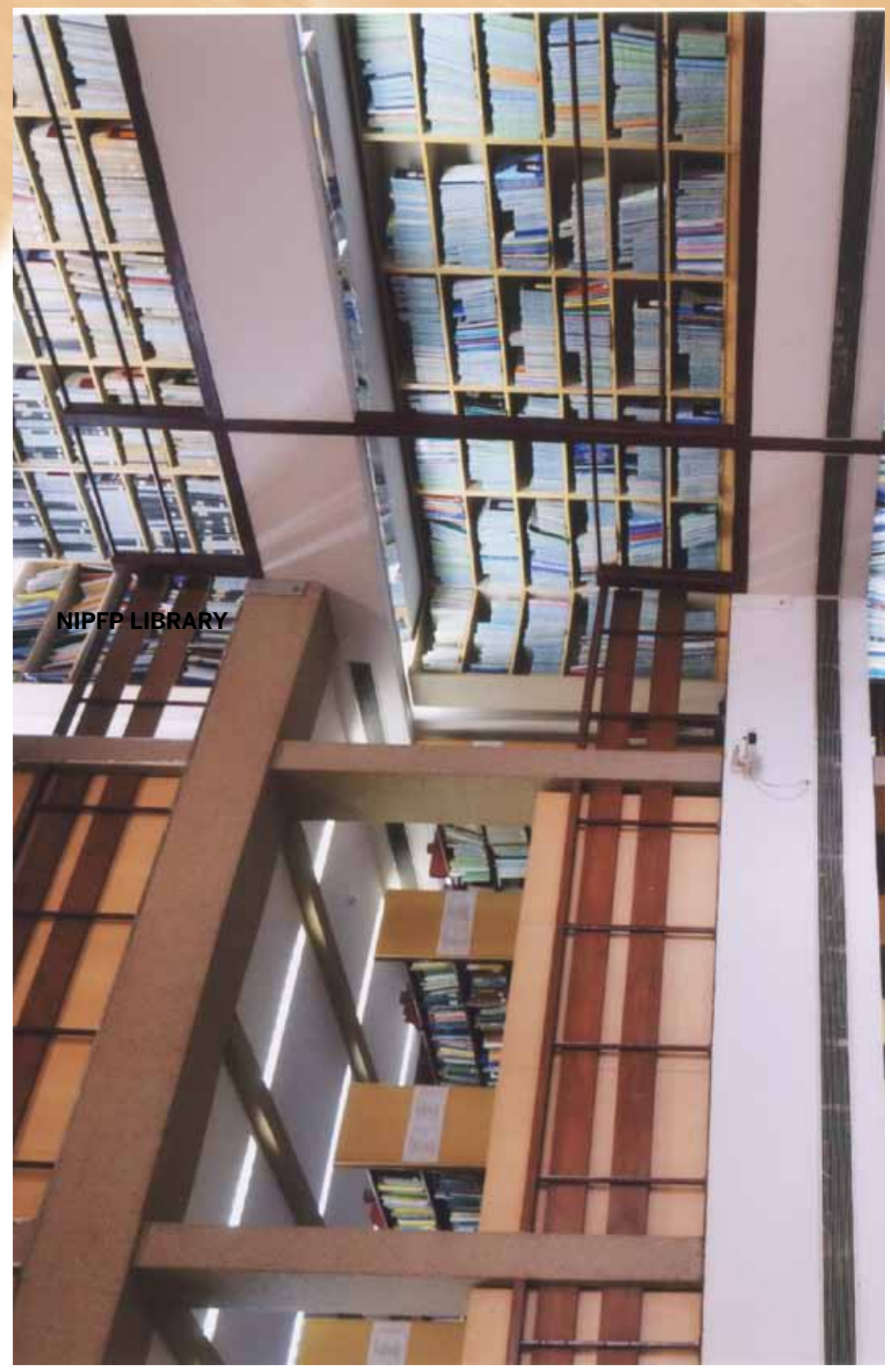
A view of NIPFP Library