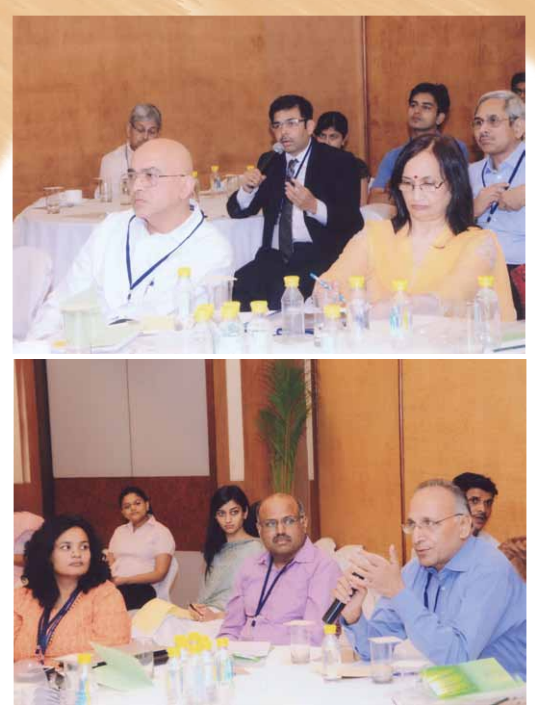
A half-day workshop, Fiscal Federal Issues in India was conducted to contribute suggestions for the terms of reference for the Fourteenth Finance Commission operative for the period 2015-20. The discussions revolved around the country's standing problems with particular focus on federal fiscal arrangements, challenges in equity, fiscal responsibility and management, and debt sustainability and focused on the needs of special and non-special category States of India.