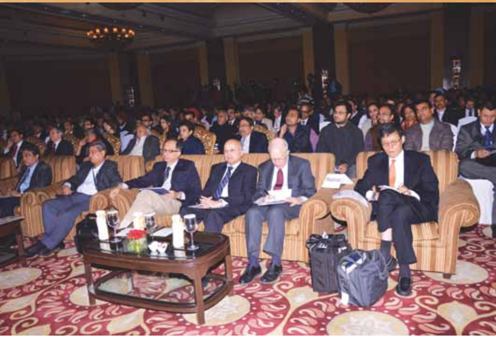
Delhi Economic Conclave, December 14-21, 2012, New Delhi